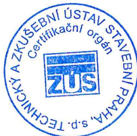
The stamp of the Certification Body

This Annex is an integral part of the certificate No. 040-075309